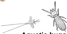
Aquatic bugs Macroinvertebrates