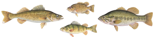
Fish Eaters Piscivores