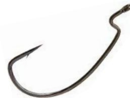
Wide gap worm hook

Great for catch and release fishing. The angled point prevents hooking soft tissue in the mouth and hooks the hard tissue of the jaw.